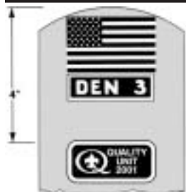
CUB SCOUT OR WEBELOS SCOUT RIGHT SLEEVE