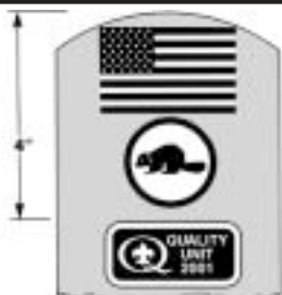
WEBELOS SCOUT RIGHT SLEEVE