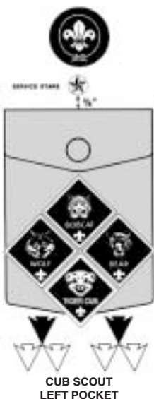
CUB SCOUT LEFT POCKET